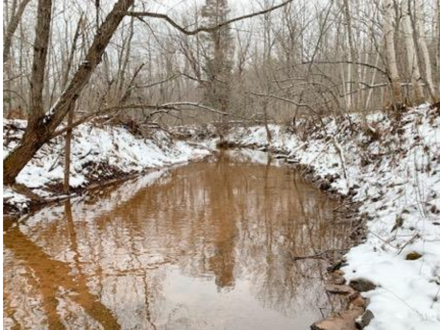
Photo of bridge location